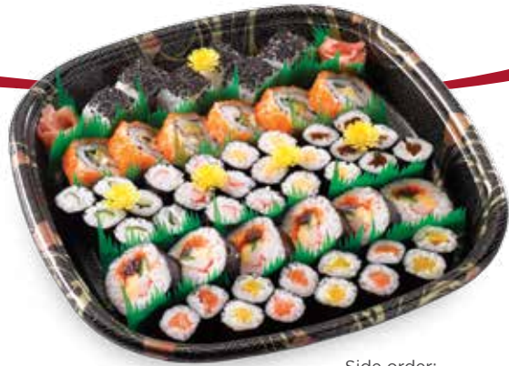
Side order: Summer Sushi Platter $58.80/set (80 pcs)

A $26.99/pax w/GST $28.88 | Min. 30 pax 9 Dishes from item: 1 - 9 Recommendation Combination A