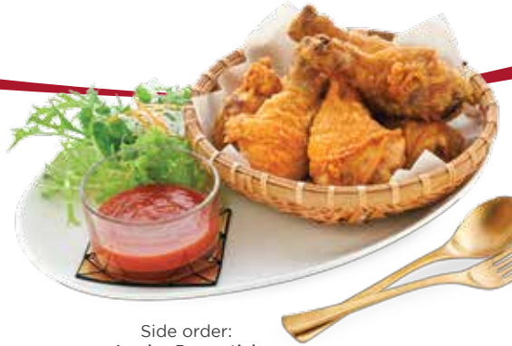
Side order: Jumbo Drumstick $1.99/pc (Min. 30pcs)

A $24.99/pax w/GST $26.74 | Min. 30 pax 9 Dishes from item: 1 - 9 Recommendation Combination A